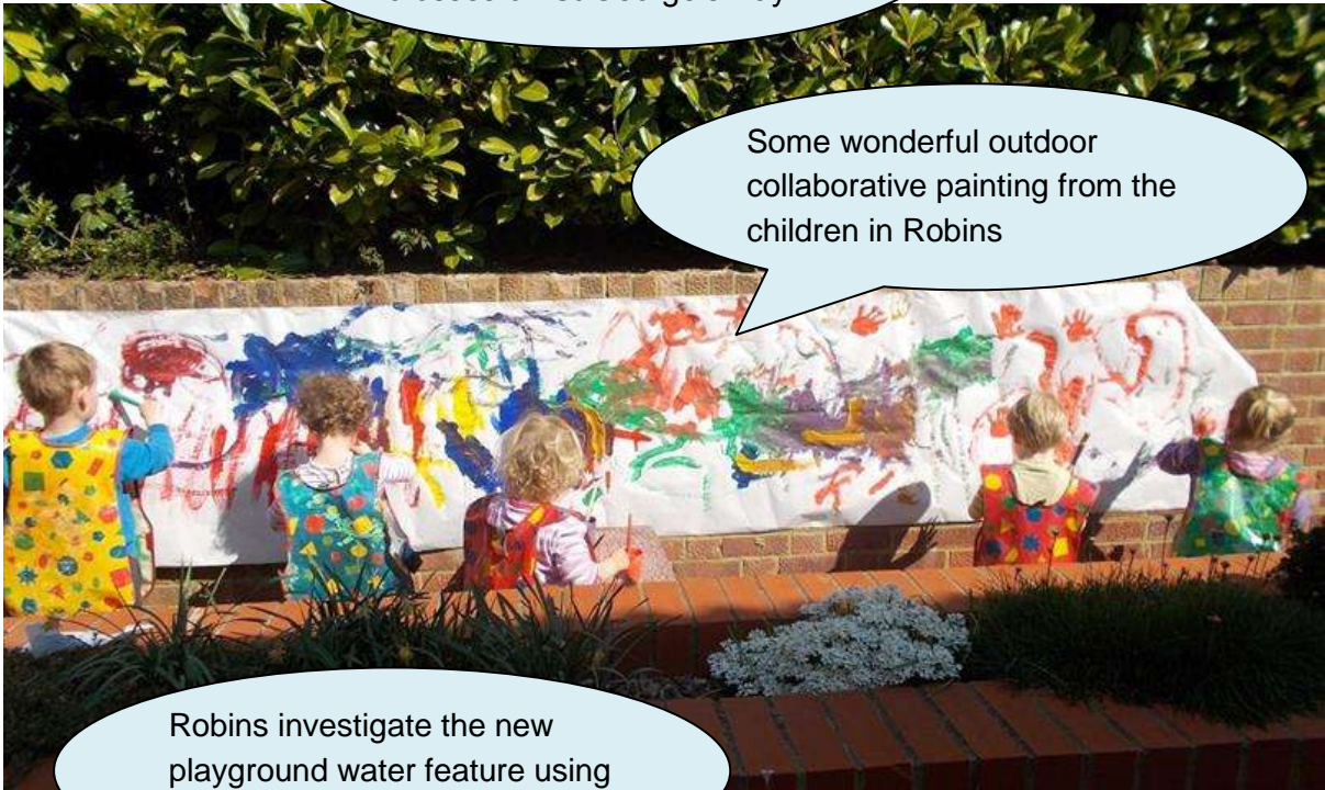
Some wonderful outdoor collaborative painting from the children in Robins