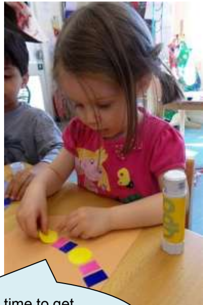
And in Robins it's time to get sticky and decorate kites ready for the when the wind picks up!