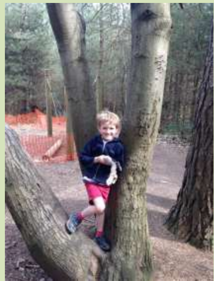
Hazelwood Fun Club at Bedgebury