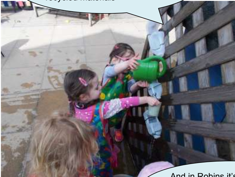
Robins investigate the new playground water feature using recycled materials